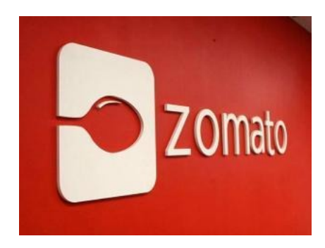
Zomato hacked, data of 17 million users stolen: Report

Bawa feels that hackers are usually one step ahead of the pack and security cannot be treated as one-time expenditure. "You have to treat a security breach as a business risk and monitor it in-house rather than outsource it to third parties," she said.