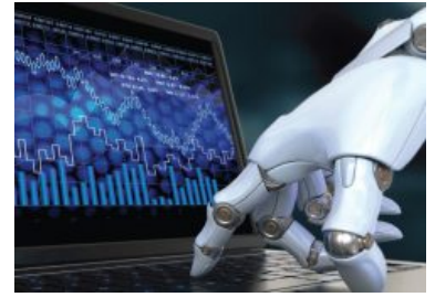
( https://news.efinancialcareers.com/us-en/287300/barclays-machine-learning-ai-and-big-data-jobs-in-hedge-funds/ )