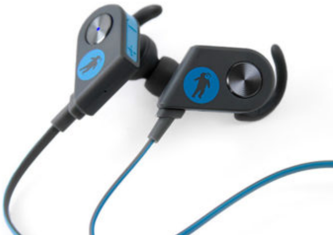
FRESHeBUDS Pro Magnetic Bluetooth Earbuds