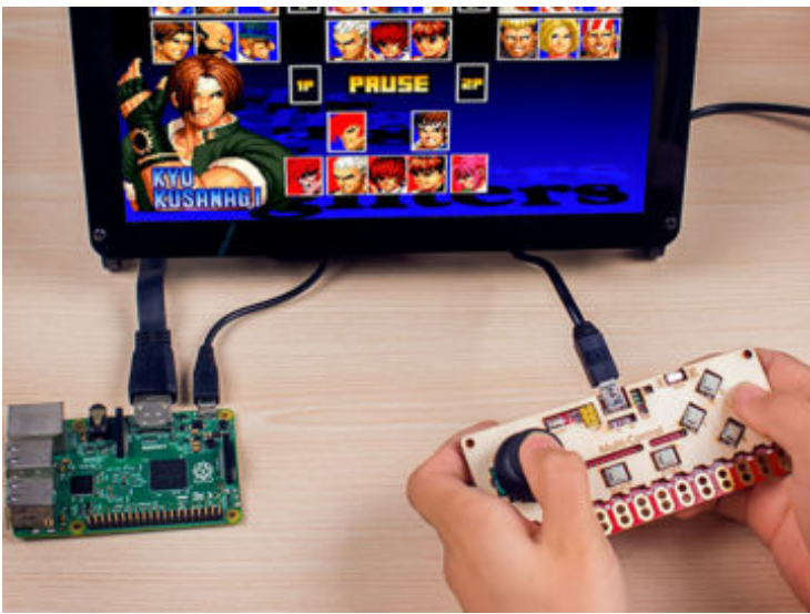
MagicKey 3-in-1 DIY MIDI Gamepad Keyboard