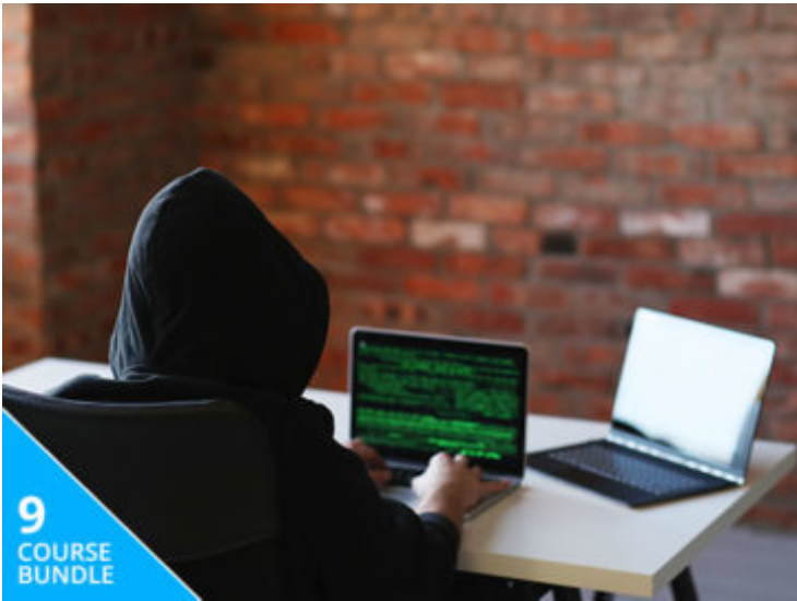
The Super-Sized Ethical Hacking Bundle