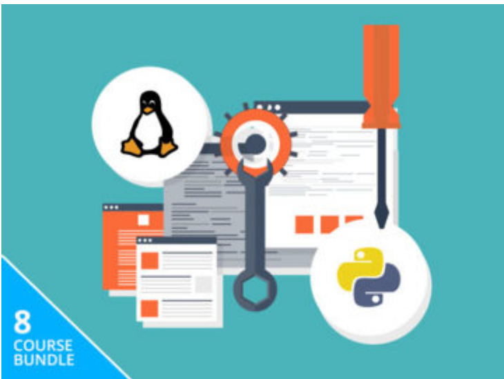
Pay What You Want: White Hat Hacker 2017 Bundle