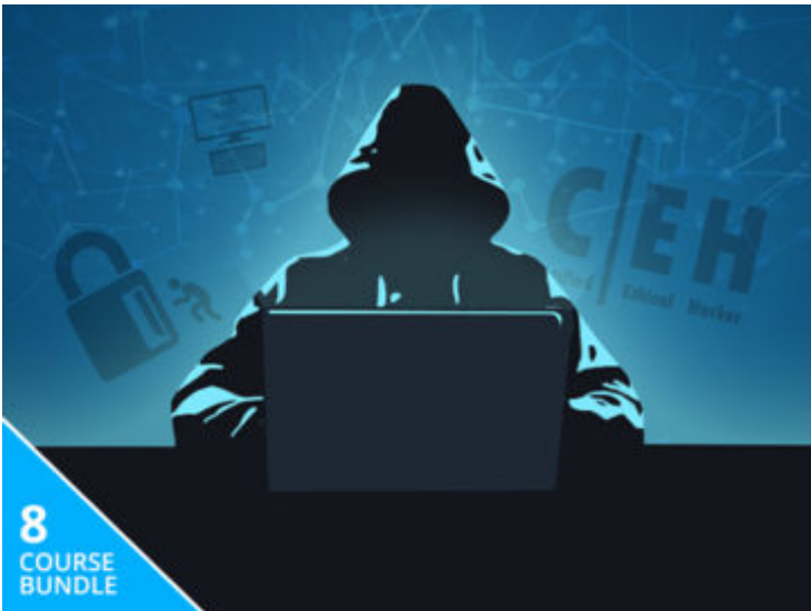
Ethical Hacking A to Z Bundle